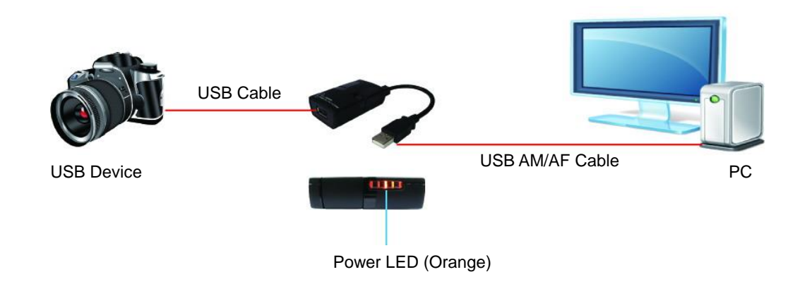
Fig 1. The USB Isolator unit is installed in-line between the PC and a connected USB device.