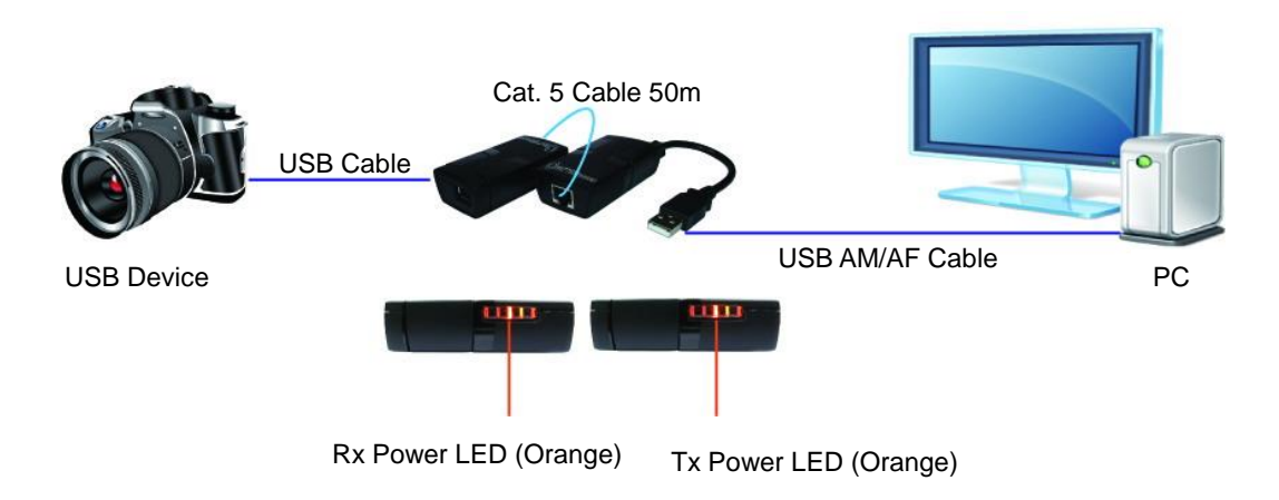
Fig 2. The USB Isolator Extender is installed over Cat.5 cable between the PC and a connected USB device.